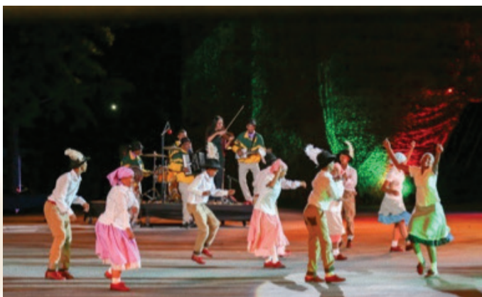
The Nuwe Graskoue Trappers from Wupperthal perform some traditional Riel dances – the girls swirl their skirts flirtatiously, while the boys respond with much vigorous foot-tapping and leaping

The Nuwe Graskoue Trappers from Wupperthal introduced their high-energy Riel Dances. This unique form of dance was born out of traditional Khoi and San ceremonial dances around the fire, and includes courtship rituals and mimicry of animal antics, along with much bravado, showmanship and foot stomping.