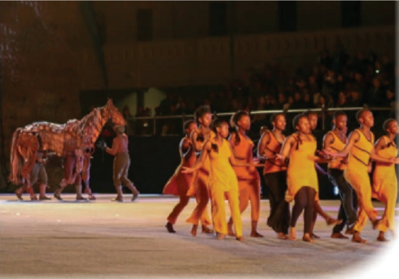
The Chris Hani Secondary School dance troupe and Joey the War Horse pay tribute to the brave men and women who fought and died in World War I"

Many of the military – and civilian – men and women involved have a remarkable 'can do' attitude and a willingness to go beyond the call of duty, to step in and assist where help is needed. Instances of this occur at all levels, from the officers at the top to the troops on the ground.