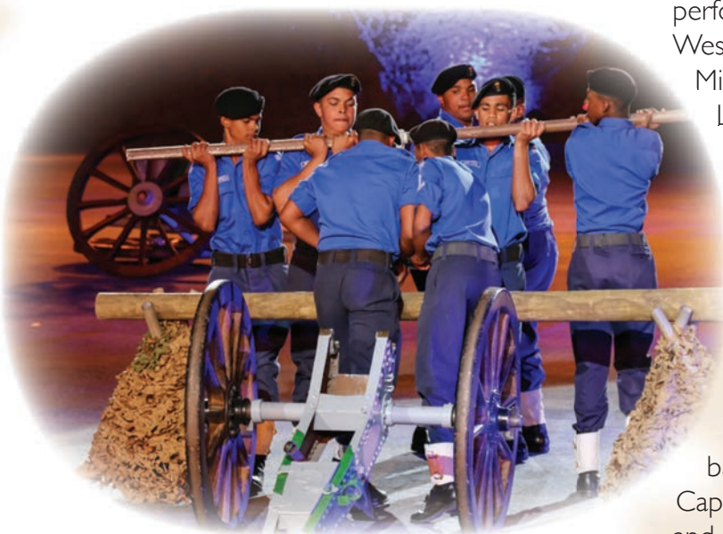
The young sea cadets of TS Woltemade manoeuvre a heavy Hotchkiss naval gun around an obstacle course

Their professionalism, discipline and dedication to their work as military musicians certainly contribute to the positive image of the SANDF. They were joined by five of the finest pipe bands in the country: the Cape Town Highlanders, Cape Field Artillery, Cape Garrison Artillery, Knysna and Districts, and Algoa Caledonian pipe bands. Spectators were kept on the edge of their seats with some dramatic high-speed action on the arena.