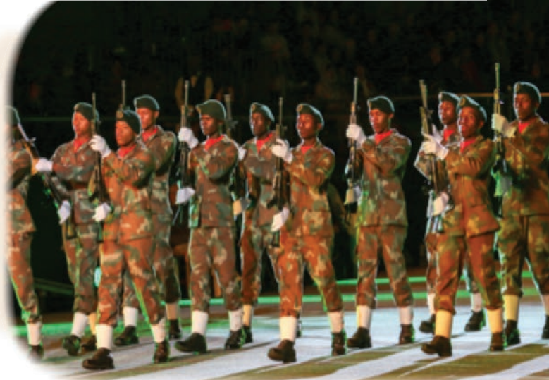
The soldiers of the Precision Drill Squad of the SA Army School of Infantry in Oudtshoorn impress audiences with their discipline and concentration

In addition to the dance troupe, this Khayelitsha school also has an excellent choir, which has won the Western Cape Provincial Championships organised by the South African School Choral Eisteddfod (SASCE) for the last three years. Two other groups of talented young local performers performed at the CTMT 2015.