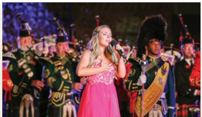
Chloë Agnew singing “The Prayer”: “Lead us to a place, guide us with your grace, give us faith so we’ll be safe.”

The band consists of the best musicians selected from the Pakistan Armed Forces bands, and their repertoire includes national anthems, classical music, national folk melodies and songs. An unusual participant in a tribute to the trench diggers and stretcher bearers of WWI was Joey, the larger-than-life naturalistic horse puppet from ‘War Horse: The Show’, a moving drama set in WWI.