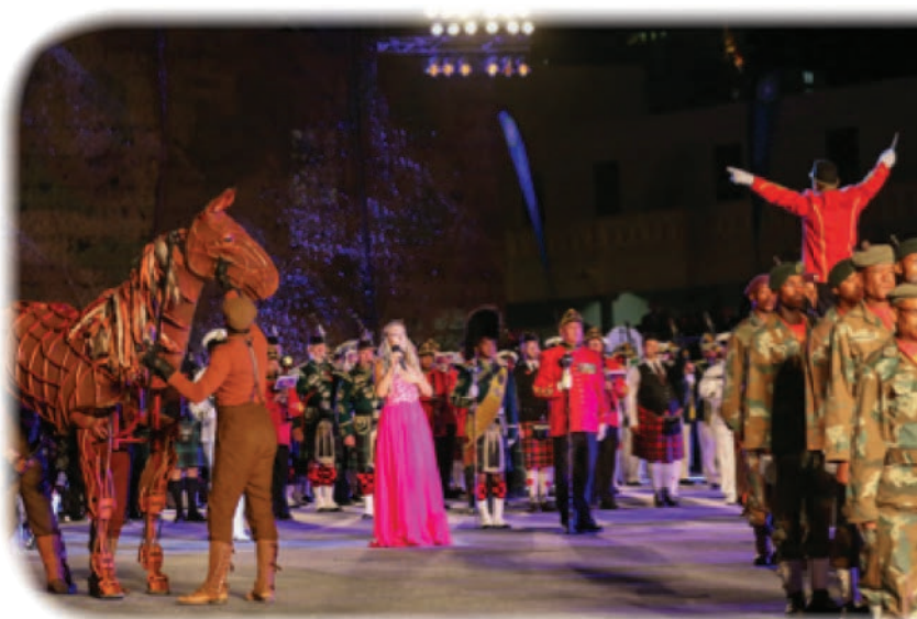
Final Muster of all the participants in the Cape Town Military Tattoo 2015 rounds off the evening