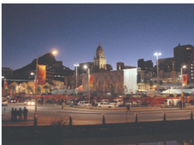
FIFA Fan Fest on the Grand Parade, as seen from the Castle

As the Defence Reserves' Provincial Office Western Cape (DRPOWC), together with the organisers of the Cape Town Military Tattoo, has accepted responsibility for youth development in Cape Town, the month-long programme at the Castle during the FIFA World Cup was a perfect opportunity to showcase the military's active involvement with regard to skills development initiatives for the youth, by giving five talented youth groups from disadvantaged areas an opportunity to perform in the grounds of the magnificent old Castle. Each group was given a guided tour of the Castle after their