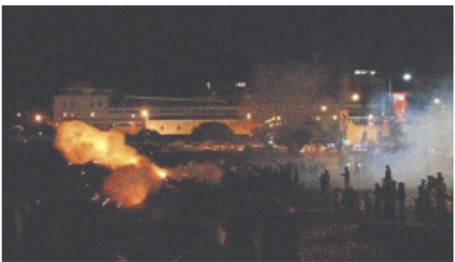
On the first and last night of the FIFA World Cup, the ceremonial gun troop of CFA fired their G1,25-pounder ceremonial guns in front of the Castle