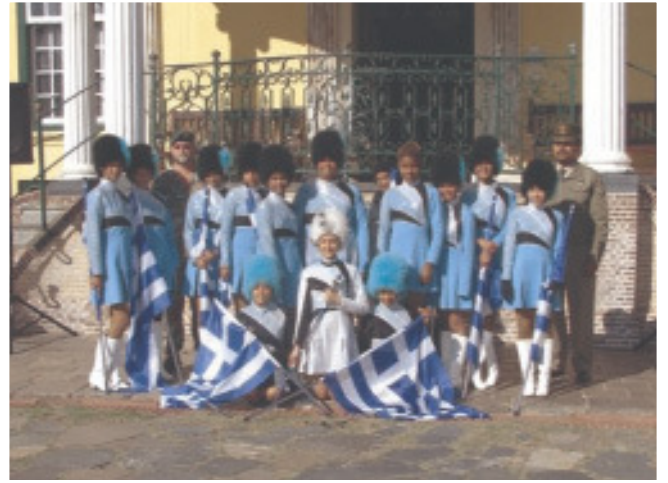
The Malibu Drum Majorettes in front of the Kat balcony at the Castle

The Eerste River Youth Brigade is a community service organisation. The Youth Brigade has been in existence for about 28 years, and their marching bands have proved to be one of the most successful mechanisms for fostering a sense of self-worth, achievement, pride, teamwork, and discipline among the youth. The