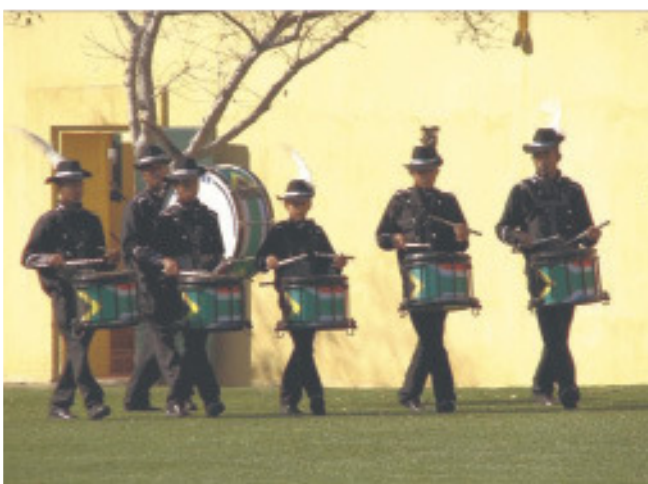
The Limited Edition Drum Corps marched into the arena, the rhythmic rat-tat-tatting of their drums creating an air of excitement

The South African Sea Cadets are a registered 21 Section Company. It is recognised by the South African National Defence Force, and the