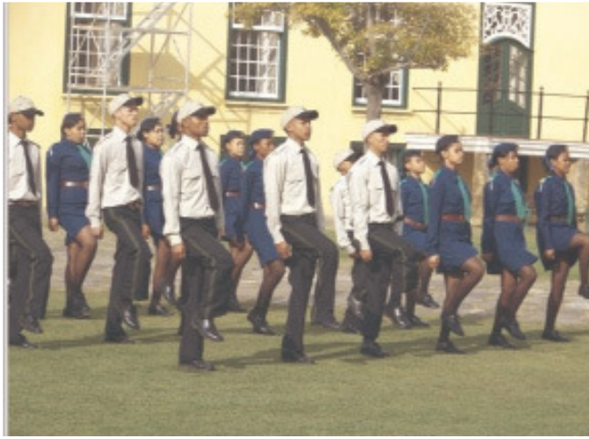
The neatly dressed members of the Eerste River Youth Brigade march in step

performances, courtesy of the Castle Office. Sergeant J. Jacobs of 3 Medical Battalion Group also addressed each youth group on the volunteer military system and the Reserves, and distributed pamphlets and the Reserve Force Volunteer magazines among them.