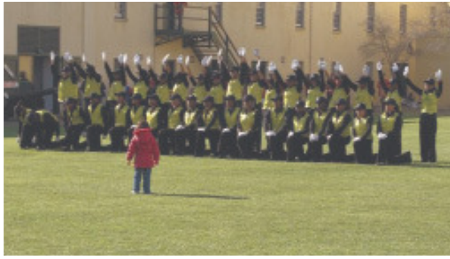
The energetic performance of the Portland High School Field Marching Band was rewarded with much applause from the spectators – and a curious youngster took a closer look!