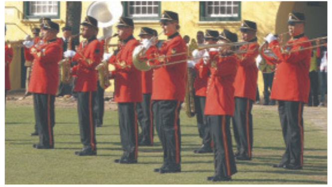
The SA Army Band Cape Town in their chilli red outfits entertained the appreciative spectators

South African Navy assists in the training of the Cadets. The first training unit, referred to as a Training Ship, was established on Woodstock Beach in Cape Town as far back as 8 June 1905. It offers character development and maritime skills training to the boys and girls, who have an average age of fifteen years. They attend school and have only Saturdays to devote to their training. This does not only consist of basic discipline and drill, but also includes seamanship, navigation, engineering, communication, catering and leadership to equip them to meet the challenges of life. The group that performed during the World Cup was specially selected to participate in the Cape Town Military Tattoo 2010.