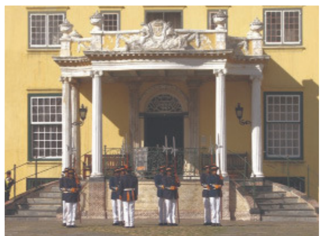
The Castle Guard Halberdiers in front of the elaborate Kat balcony during the daily Changing of the Guard Ceremony