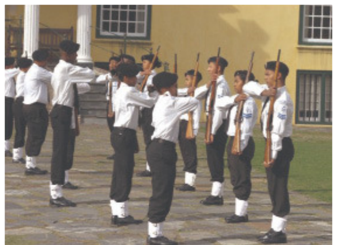
The South African Sea Cadets in their black and white uniforms performing a gun drill