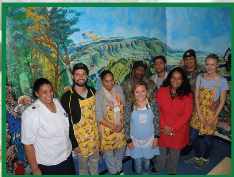
Members of the Regiment visited one of the children's specialist wards at Red Cross War Memorial Children's Hospital, meeting with other volunteers and members of the nursing staff.