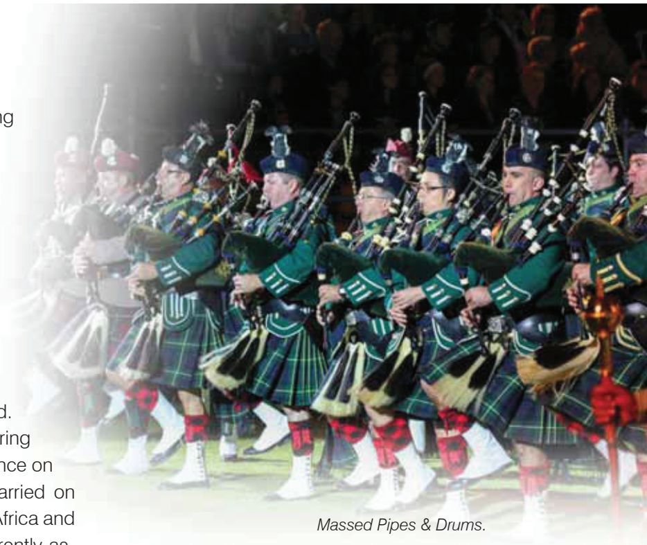
Massed Pipes & Drums.

The men of the SAASIC and their motorcycles made another spectacular appearance later in the show. The SANDF is in daily service of the people of South Africa in ways that we may not appreciate, including border control operations, support of other state departments and peace-keeping operations under the auspices of the United Nations and the African Union. They are also deployed in major game reserves to assist in curbing the ongoing scourge of