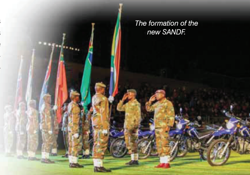
The formation of the new SANDF.

In a final symbolic demonstration of unity, the Prelude and Sunset during the Final Muster gave us all a moment to reflect on the inspirational shift that we as South Africans have made, as we enter our third decade of democracy. For inspirational and educational content, colourful pageantry and brilliant music, the 2014 Cape Town Military Tattoo will be hard to beat. As the final notes drifted into the night sky and the last spotlight faded away, it was clear that the 2014 Cape Town Military Tattoo had been a tremendous success. ⚙️